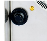
Magnetic circuit breaker on secondary to protect lighting system