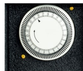
Built-in timer Non-removable pins