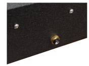
Built-in Photocell Non-removable