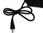
6 Foot plug-in cord